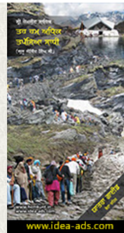
Free Hemkund Sahib Yatra Guide

View New Responsive Website of Hemkund Sahib Yatra