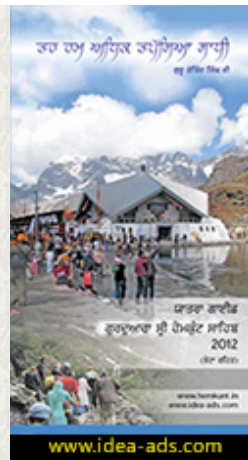
Free Hemkund Sahib Yatra Guide