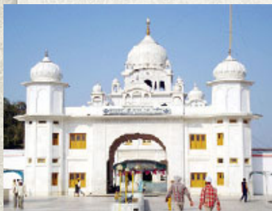
Gurdwara Nanak Matta Sahib