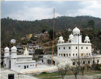
Gurdwara Reetha Sahib

Guru Gobind Singh Ji the Tenth Master in one of his great holy compositions entitled "Bachittar Natak" while giving a hint or pointing out this good site Hemkund Sahib or Hemkunt Sahib: